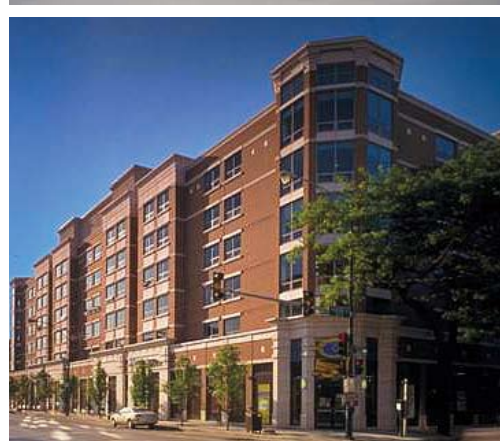
OFFICE • INDUSTRIAL • RETAIL • HEALTHCARE • RESIDENTIAL AIRPORT DISTRIBUTION • STUDENT HOUSING • MIXED-USE