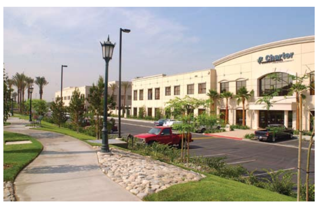
Above, Irwindale Business Center, Industrial, (18 buildings, 1,184,000 sq. ft.), San Gabriel, CA