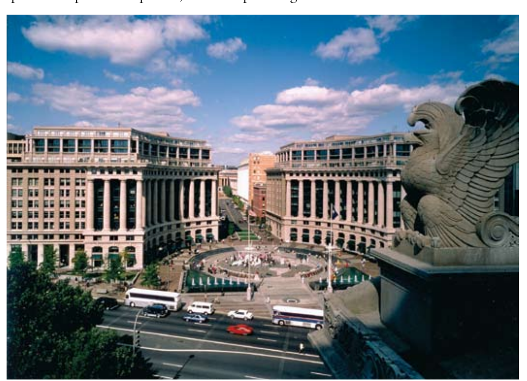
Left, Chase Tower, Class A Office Building (1,296,407 sq. ft.), Dallas, TX; above, Market Square, Mixed-use - office, residential, retail, museum (1,400,000 sq. ft.), Washington, DC

It is the unique combination of local and national expertise and resources within Trammell Crow Company that has always allowed us to stand out, to succeed and to deliver for our clients and investor partners. We build value for the long term.