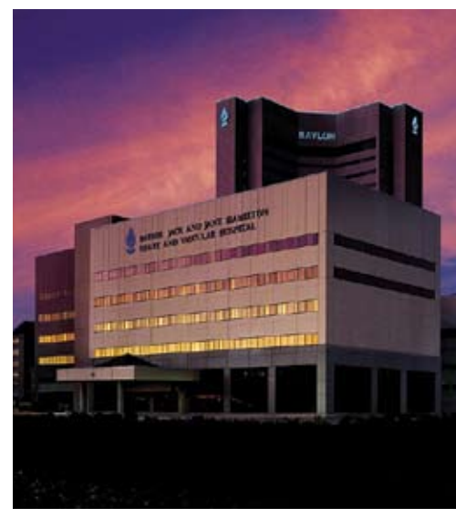
Left, 2000 Avenue of the Stars, Office Building (775,000 sq. ft.), Los Angeles, CA; above, Baylor Heart and Vascular Hospital (185,000 sq. ft.), Dallas, TX.

We recognize that with every project, success is in the details.